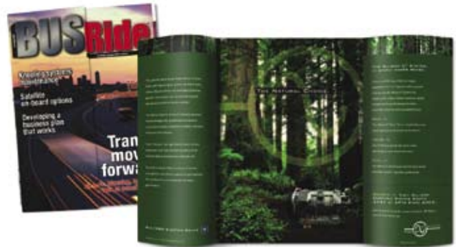
French Door Cover

Extra distribution at the largest industry trade shows: UMA, ABA, BusCon & APTA. Polybag opportunities available.