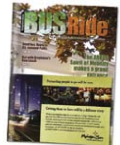
Half Cover Tip