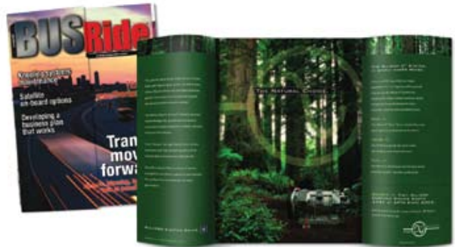
French Door Cover

Extra distribution at the largest industry trade shows: UMA, ABA, BusCon & APTA. Polybag opportunities available.