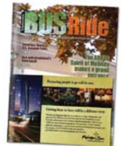
Half Cover Tip