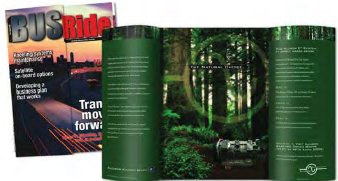
French Door Cover

Extra distribution at the largest industry trade shows: UMA, ABA, BusCon & APTA. Polybag opportunities available.