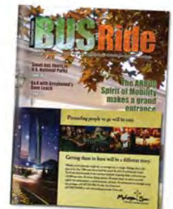
Half Cover Tip